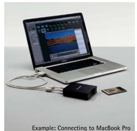
Example: Connecting to MacBook Pro

* The 30 MB/s transfer rate is the maximum rate. The actual transfer rate may be lower due to various factors, such as the file being transferred, the performance of the system (computer/OS) used, the application software and the P2 card version.