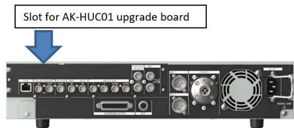
The AK-HCU250 Camera Control Unit

AK-HUC01 4K/12G-SDI Interface kit April 2021, Panasonic Corporation