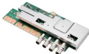
4K Output Board