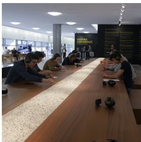
Marina Abramović invites visitors to Moderna Museet to take time out to do something mundane, by counting rice and lentils in silence