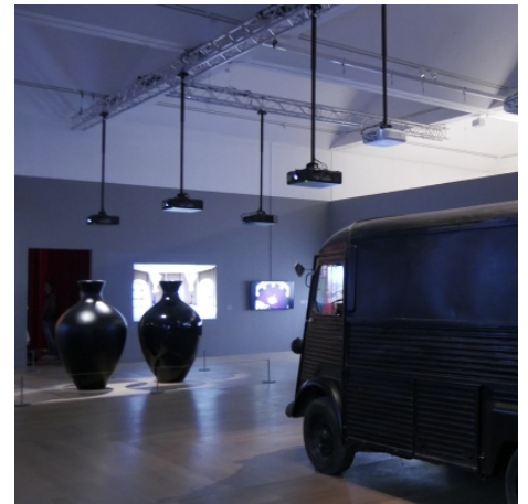
Marina Abramović utilises Panasonic laser projection to display her work with artist and partner Ulay