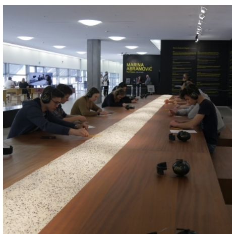
Marina Abramović invites visitors to Moderna Museet to take time out to do something mundane, by counting rice and lentils in silence