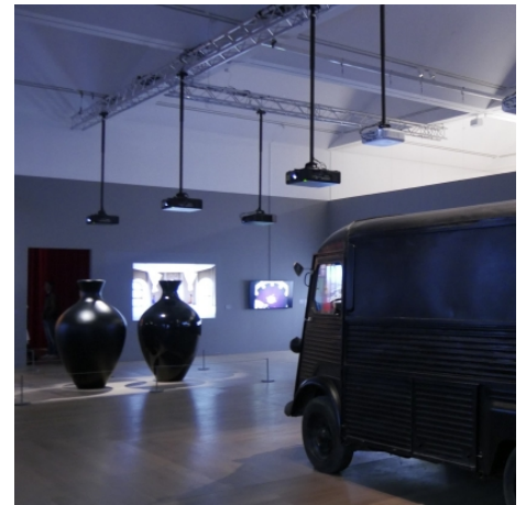
Marina Abramović utilises Panasonic laser projection to display her work with artist and partner Ulay