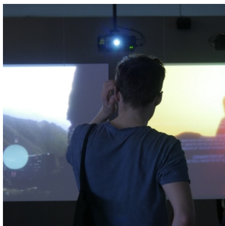
Marina Abramović utilises Panasonic laser projection at the Moderna Museet