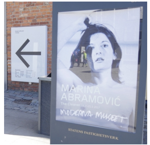
Marina Abramović at the Moderna Museet in Stockholm

The artist is present - 6 x PT-RZ570 projectors 1 x TH-55LF8 display