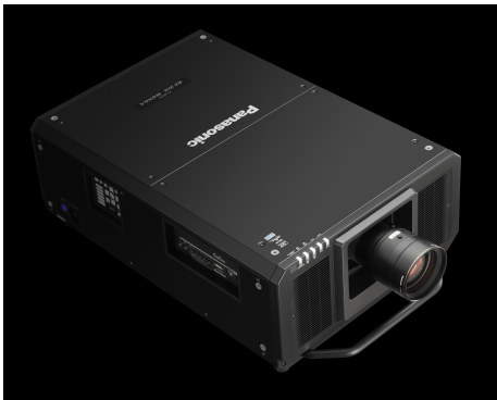
Seven PT-RZ31K high-performance laser projectors each with 30,000 lm were used

The festival is held around the 8th of December when the inhabitants of Lyon celebrate the Virgin Mary, whose statue can be found at the Basilica de Fourvière overlooking the city. They place candles and lamps on their windowsills and balconies and parade through the city.