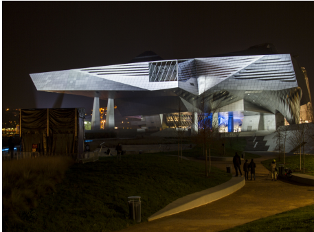
View depicting the unique shape of the Musée des Confluences