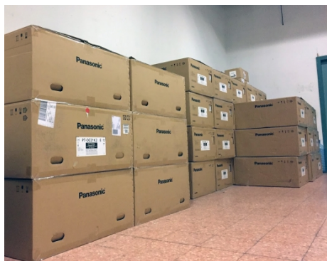
Panasonic projectors upon delivery, still packaged.