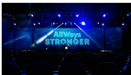
The three plenary halls, with two to four thousand seats, including an 1,800-seat auditorium.