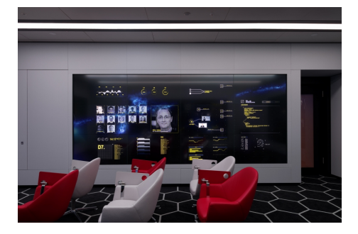
48 TH-55VF1HW displays create a collaboration room of the future