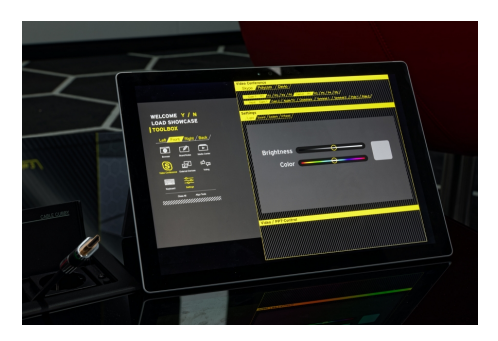
User-friendly content control