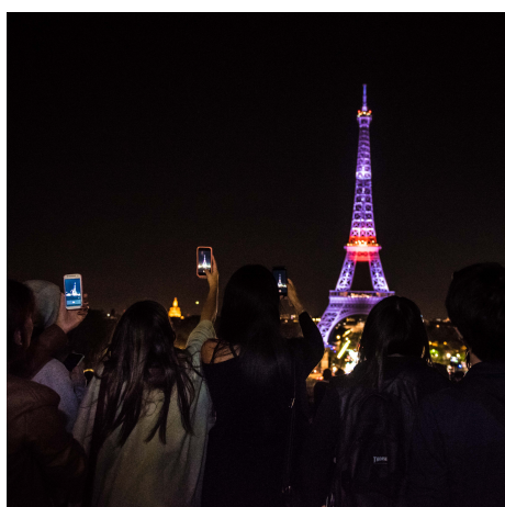
Images of the public on the Place du Trocadéro, Paris

Alongside Panasonic, Magnum was also a partner company for the installation. It was responsible for the technical integration of the project.