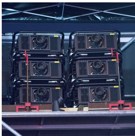
Panasonic PT-RZ21K projectors