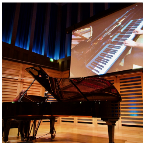
Live recording using the HE130

Opened in 2008, Kings Place, the independently-funded arts and conference venue, presents a diverse range of music and visual arts.