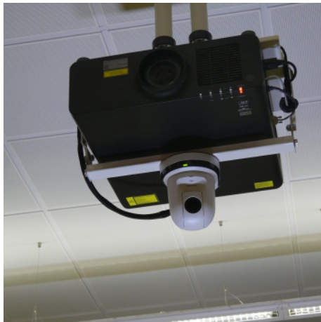
Projection and remote cameras combine at Edge Hill University

Competition among universities has rarely been as fierce as it is at present. According to the UCAS clearing house, while an increasing proportion of English 18-year-olds accepted places on undergraduate courses, the overall number of acceptances to British universities has declined after sharp falls among applicants aged 19 and older.