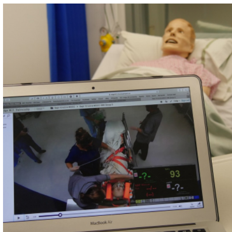
Lecture capture of an ODP practical assessment

This makes use of the AV infrastructure within the lecture theatres and a separate control desk equipped with an AW-RP50 - compact PTZ controller in order to live stream the ceremony.