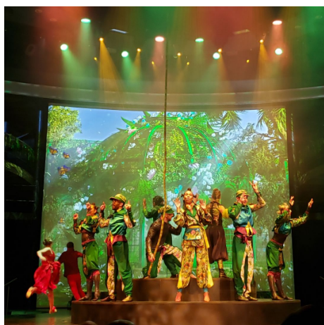
Oculus theatre