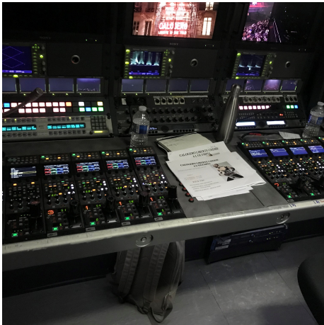
Panasonic AK-HRP1000 remote operation panels

"After comparing all the different rival models on the market, investing in VariCam LT cameras was a no-brainer", explains Nicolas Foulon, Managing Director of HDLOC.