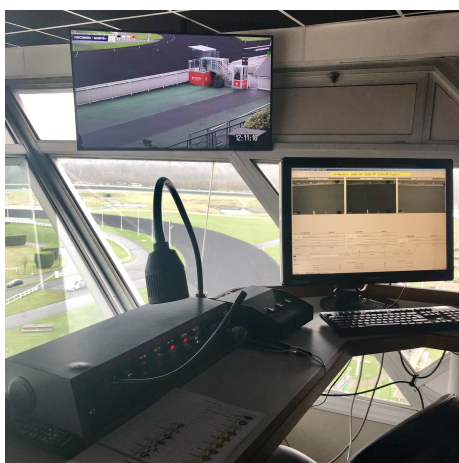
Software for camera control and recording