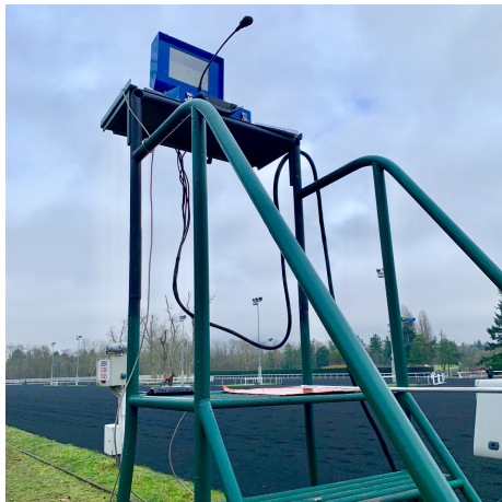
Stand for checking false starts