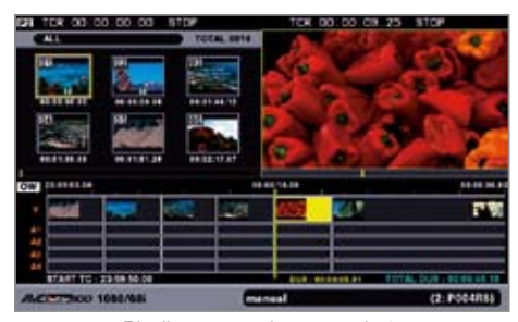
Playlist preparation example 2: Displaying thumbnails