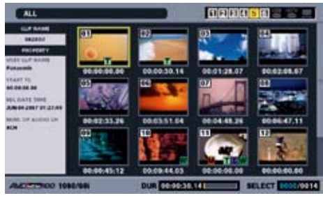
Example of a thumbnail list (LCD and monitor output)