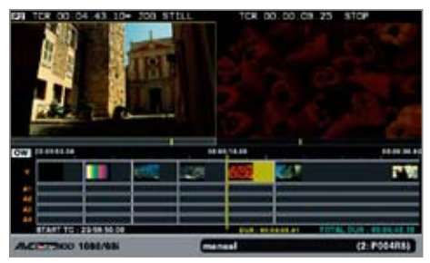
Playlist preparation example 1: Displaying player side and recorder side playback screens (with the player side selected)