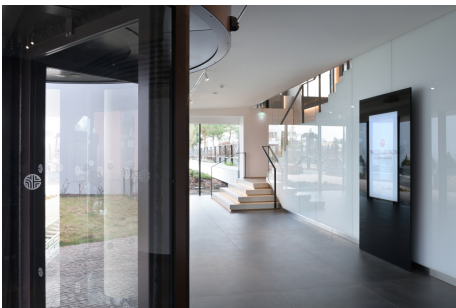
55" navigation display

Compact and Flexible 1-Chip DLP™ Projectors PT-RZ990 deliver the brightness, resolution and colour that designers need to enhance exhibits with bright, bold, and vivid pictures. Maintenance free up to 20.000 hours with dust-resistant optical block and long lasting laser engine.