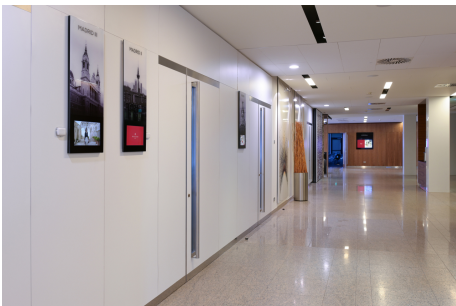
Information panels with 43" displays in front of lounge entrances