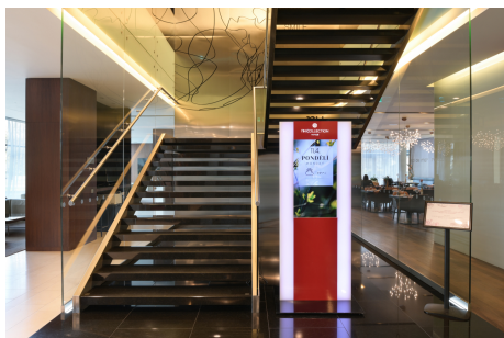
Information display in the hotel lobby