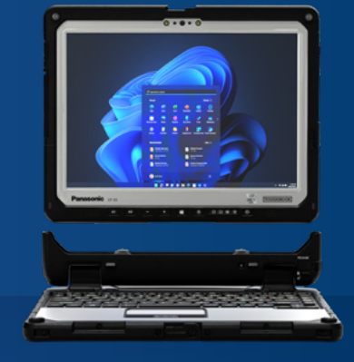
TOUGHBOOK 33 12"