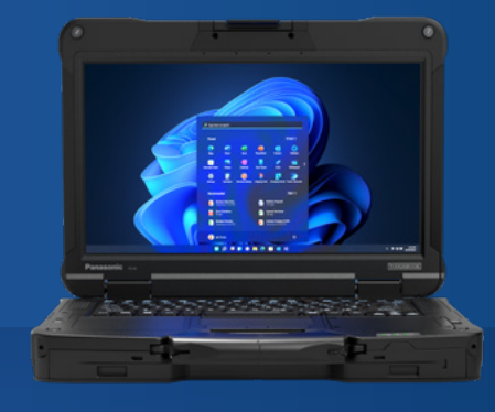
TOUGHBOOK 40 14"