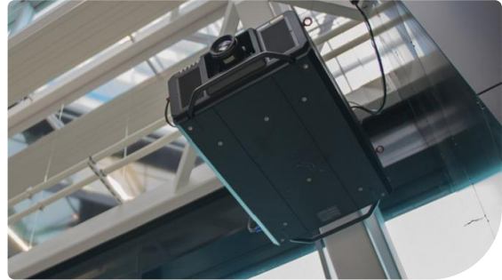
Panasonic PT-RZ31K laser projector in the vestibule