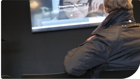
The press conference space at Media City Bergen