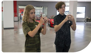
Two children showing how to use the mobile app embedded with the LinkRay