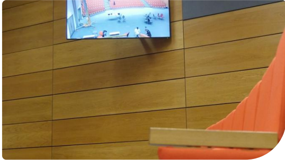
Repeater monitors at Edge Hill University