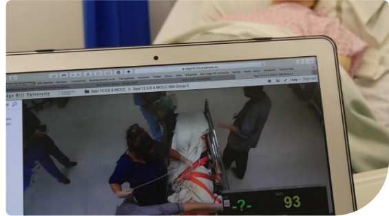
Lecture capture of an ODP practical assessment