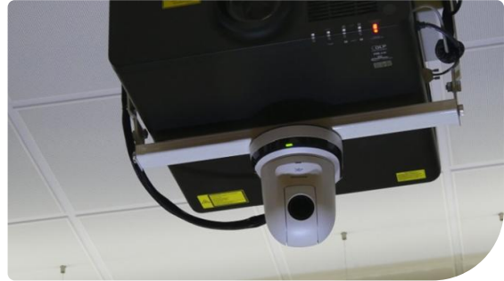
Projection and remote cameras combine at Edge Hill University