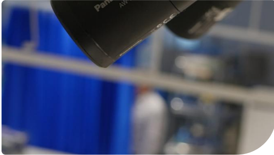
Remote camera technology in use in the clinical skills room