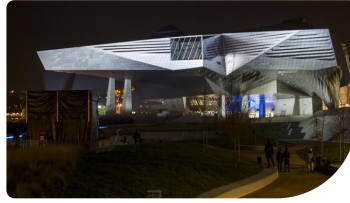
View depicting the unique shape of the Musée des Confluences