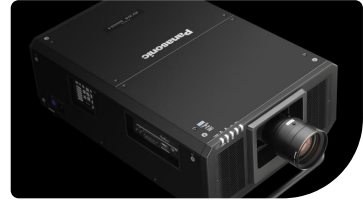
Seven PT-RZ31K high-performance laser projectors each with 30,000 lm were used