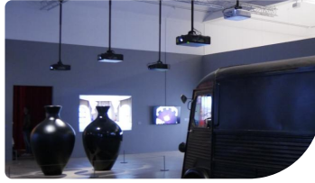
Marina Abramović utilises Panasonic laser projection to display her work with artist and partner Ulay