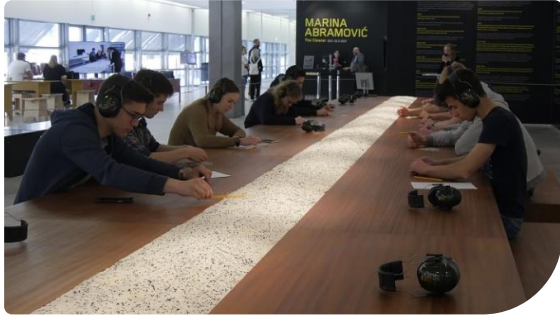
Marina Abramović invites visitors to Moderna Museet to take time out to do something mundane, by counting rice and lentils in silence