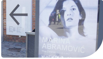
Marina Abramović at the Moderna Museet in Stockholm