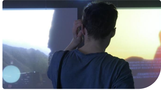
Marina Abramović utilises Panasonic laser projection at the Moderna Museet