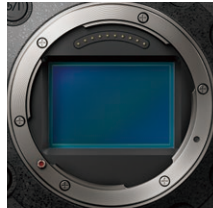
Sensor in AW-UB50

The AW-UB50 boasts a 24.2-megapixel full-size MOS sensor and the AW-UB10 features a 10.3-megapixel 4/3-inch MOS sensor, both realizing high-quality video with excellent color reproduction and resolution. The high-sensitivity, large-format sensors achieve a shallow depth of field for emotional expressiveness with beautifully blurred backgrounds. In addition, detailed expressions can be captured even in low-light environments thanks to wide dynamic range (AW-UB50: 14+ stops / AW-UB10: 13 stops).